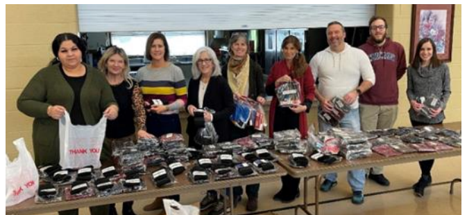
Single Point in Time Team packing blessing bags