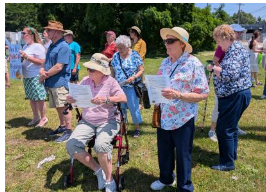
About 75—100 people showed up at the Sisters Speak Out echo event in Erie on June 24.

At the end of the prayer, the group was encouraged to call our senators to ask them not to defund vital programs for the most vulnerable members of our community. If you are so inclined, please do that also.