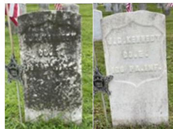
Before cleaning After cleaning

If you would like to help with this project, please contact me at either 814-881-6088 or betsy.wiest@ssjerie.org