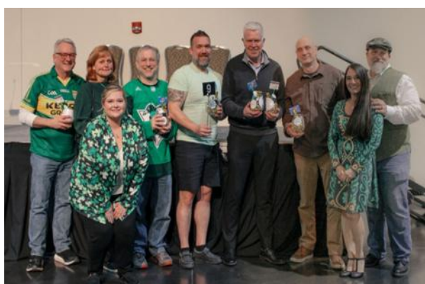
First Place: The Mutants at Table 9 John Russell Hospitality Co.

Mark your calendars for the second annual Shamrock Showdown on Saturday, April 3, 2027. Get ready for another exciting night of trivia, fun, and community as we come together to support St. Patrick's Haven. We can't wait to see you there!