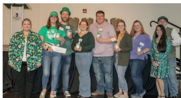
Second Place: Luck O' the Pipeline National Fuel