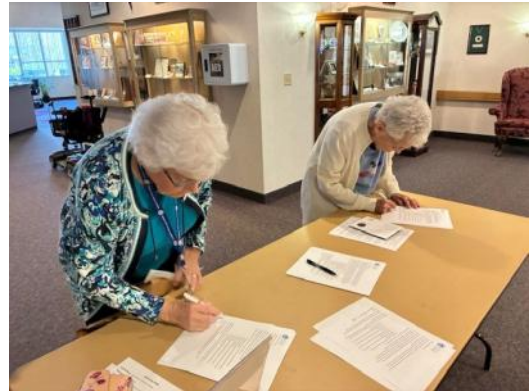
Signing letters to our congressmen (See page 8)

All-powerful God, you are present in the whole universe and in the smallest of your creatures. You embrace with your tenderness all that exists. Pour out upon us the power of your love, That we may protect life and beauty. Fill us with peace, that we may live as brothers and sisters, harming no one. O God of the poor, help us to rescue the abandoned and forgotten of this earth, so precious in your eyes. Bring healing to our lives, that we may protect the world and not prey on it, that we may sow beauty, not pollution and destruction. Touch the hearts of those who look only for gain at the expense of the poor and the earth. Teach us to discover the worth of each thing, to be filled with awe and contemplation, to recognize that we are profoundly united with every creature as we journey towards your infinite light. We thank you for being with us each day. Encourage us, we pray, in our struggle for justice, love and peace.